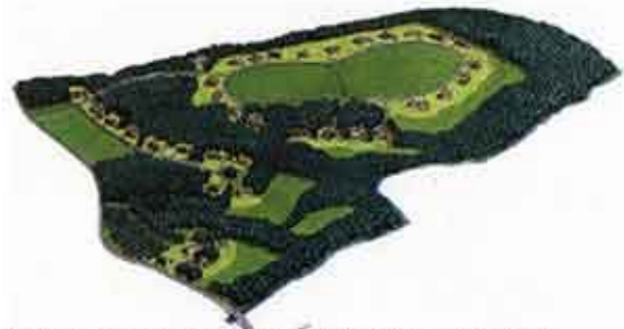
Layouts such as this one in North Carolina, in which the development has been designed around the most significant natural and cultural features, can easily be created by following the logical four-step design process described and illustrated in this book.