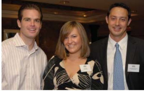
Representatives from First Sterling Financial